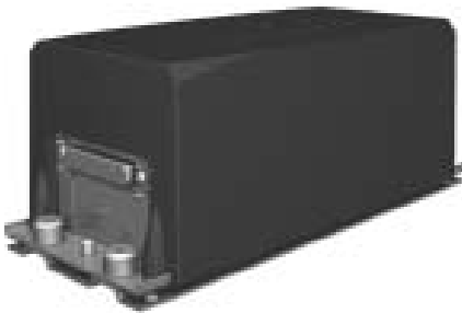
Figure 3-5 The AHRS is a solid-state replacement for mechanical gyros.

It's also fast to initialize. On the ground during start-up, all instruments are usually available within 45 seconds. In addition, the GRS 77 AHRS can be reinitialized in flight, should power be interrupted. Reinitialization can occur even while the airplane is in a bank of up to 20°, and some factory pilots have seen it reinitialize in up to a 45° bank. In contrast, the reference systems in some other glass cockpits, including jet aircraft, require that the system remain motionless for several minutes during initialization and the systems cannot be reinitialized in flight.