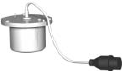
Figure 3-6 The Magnetometer senses an airplane's heading. © Garmin Ltd. or its affiliates