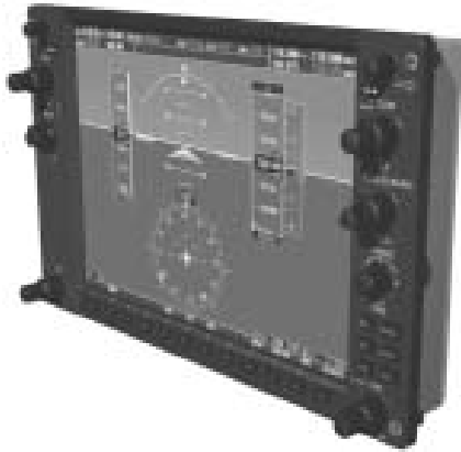
Figure 3-2 Manufacturers can now choose from 10, 12, and 15-inch displays. © Garmin Ltd. or its affiliates

When you buy a new plane, not only will you receive a copy of the Pilot Operating Handbook (POH), but you'll also receive a CD with a copy of the software loaded onto your system. In some cases, maintenance personnel may need this disk to reload the software onto your system after it's been serviced. You'll want to keep the CD in a safe place, particularly if it's a rental aircraft used by many people. In addition, when the G1000 is first turned on, you should verify that the aircraft's software version is correct—in case software for another airplane model was inadvertently loaded after your system was serviced.