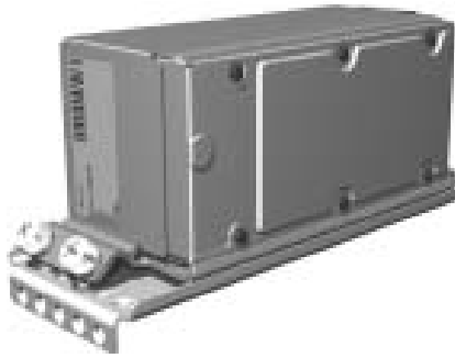
Figure 3-4 The GDC 74A processes air data from the pitot-static system.

The audio panel is mounted in most aircraft between the PFD and MFD, and it communicates with the GIA 63s using an RS-232 connection. At the bottom, it includes a Display Backup button, which can be pushed in an emergency if one of the displays were to fail. When pushed, it displays the primary instruments on whichever display remains.