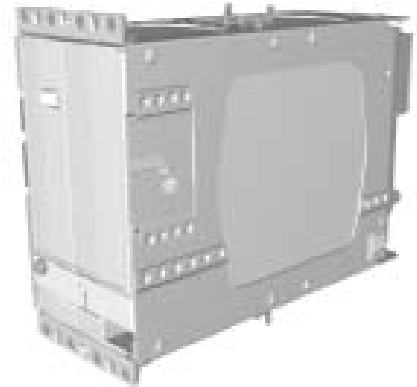
Figure 3-3 The GIA 63 is similar in functionality to the Garmin GNS 530.

The GMA 1347 provides all of the features of modern audio panels. It allows you to select the radios on which you're transmitting and receiving, and lets you listen to any of the navigation radios to identify a station. It also integrates an intercom system, marker beacon receiver and a digital clearance recorder.